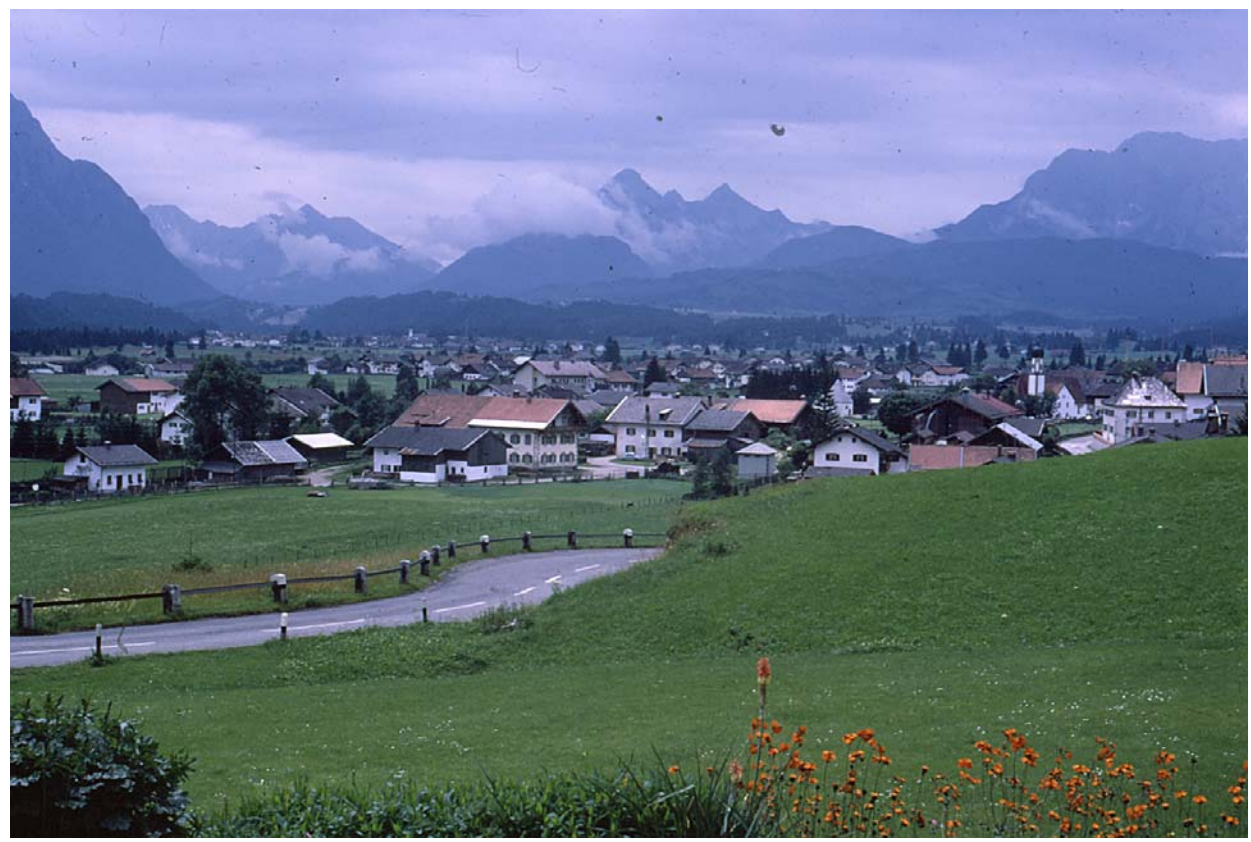
Deuthschland über alles!